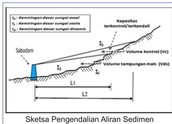
Sketsa Pengendalian Aliran Sedimen